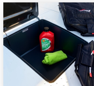
Storage in two wing lockers

The Empty Weight specified here is an indicative standard empty weight only. This will vary depending on the options you choose for your own aircraft.